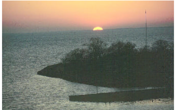
Fall 1997 Sunset from Fort Henry

We publish only that which is submitted! (There are no expense accounts and no reporters) If there is no news about your area that means we haven't received any!